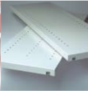
Shelf perforated 2 and 3 rows

Use to store all kinds of documents and goods. For shelving systems with 390 mm nominal depth, also use to store documents in two-point lateral suspension files.