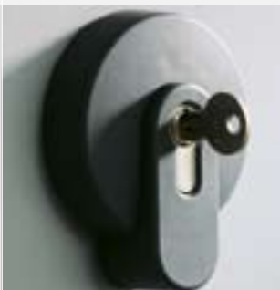
Sliding doors and roller front doors