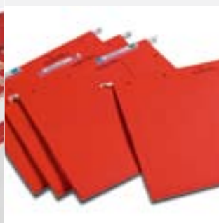
l'Oblique / TUB frame