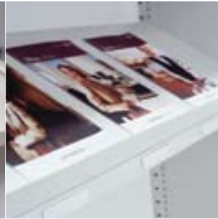
Display shelf and magnetic labels

Increase the maximum permissible shelf load for steel shelves with nominal depth 350 mm and more.